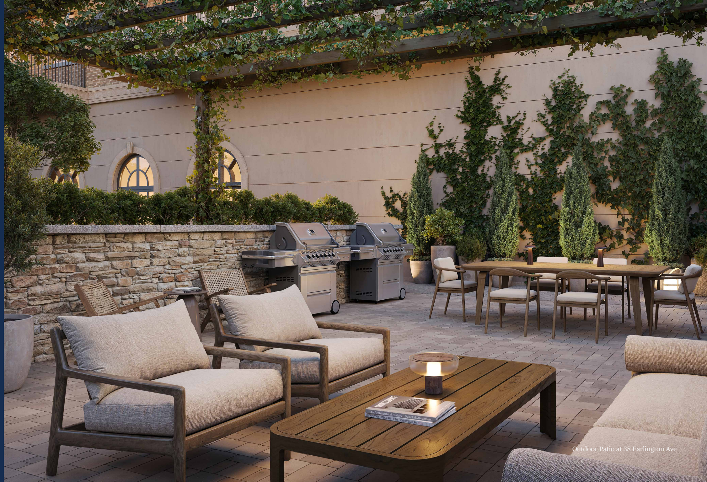
Outdoor Patio at 38 Earlington Ave

Hosting out-of-town guests is equally effortless, with a dedicated guest suite available on-site. Residents also enjoy a host of practical conveniences in the underground parking level, including EV charging stations, a car washing bay complete with vacuum, visitor parking, bicycle storage, and storage lockers. Here, you'll find everything you need to live with ease and confidence.